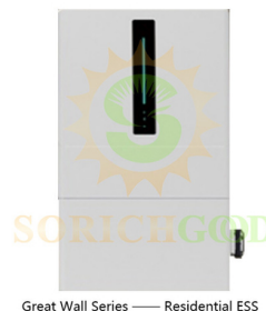
Great Wall Series — Residential ESS