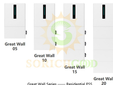
Great Wall Series — Residential ESS