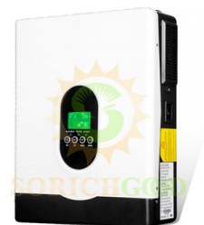
SK-E-SUN 4.2KVA-6.2KVA On&off Grid MPPT Solar Inverter