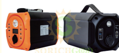
GFS-ESS-P SERIES Portable Outdoor Power Supply Energy Storage Inverter